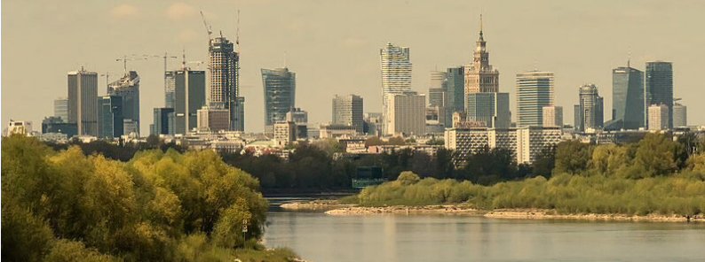
WIKI CREATIVE COMMONS